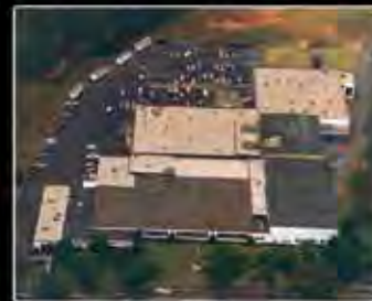
MATTHEWS, NC Corporate Headquarters