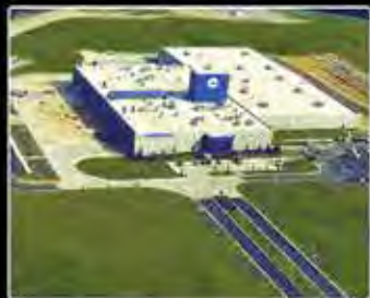
PAGELAND, SC Bronze Foundry and Manufacturing Plant

The Conbraco line continues to expand with new products, designs and advanced materials to better serve the needs of our customers. Markets served include: chemical processing, pulp and paper, petroleum, residential and commercial plumbing and heating, OEM, irrigation, water works, and fi e protection.