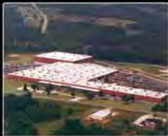
PAGELAND, SC Final Assembly and Distribution Center