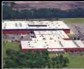
CONWAY, SC Steel Foundry and Manufacturing Plant